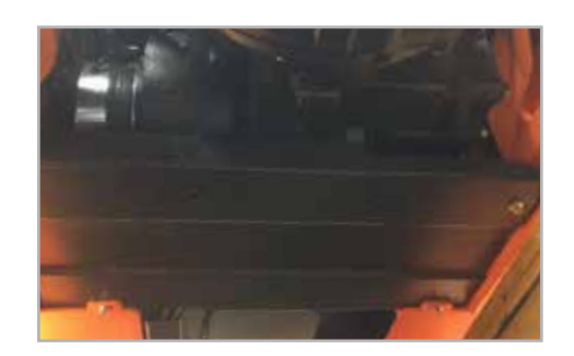
Under cover OPTION